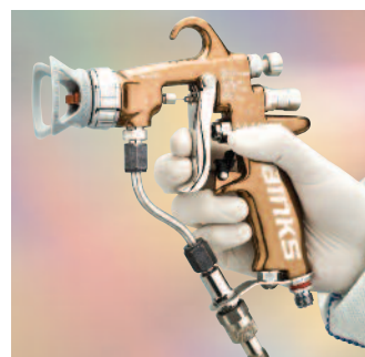
Pt. No. 0909-4400-10000E AA4400M AAA GUN with AA10 Air Cap