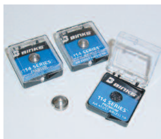
Premium fine finish and twist tip range available